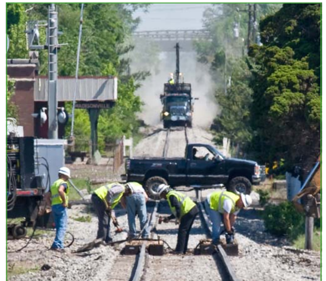
A CSX MOW crew works on repaving the crossing at West Broadway Street, Madisonville, Ky on Wednesday, May 5th, 2010 during the current right-of-way upgrades on the Henderson Subdivision.