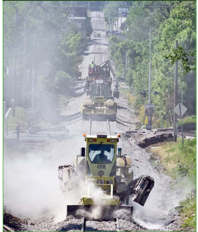
A CSX spreader smooths out the ballast through, Madisonville, Ky as it approaches the overpass on North Main Street, Wednesday, May 5th, 2010 during the current right-of-way upgrades on the Henderson Subdivision.